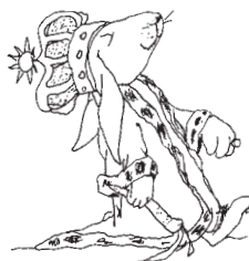
The Kungle Jing (p. 55)