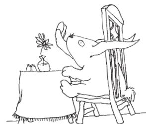
Runny Loes to Gunch (p. 71)

More than one voice is represented in these poems. In "Kugs and Hisses" (pp. 16-17) readers hear from a narrator and two characters. Here is an example of how this poem-play might be written and performed: