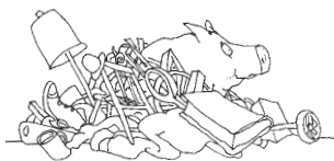
Ploppy Sig Reans His Cloom (p. 15)

Explain to students that Shel Silverstein was also a performer, in addition to being a writer and an illustrator. In honor of Silverstein's love of theater, have students work in partnerships or small groups to act out Runny Babbit poems. Students should create scripts so other people can act out the poems as well. Good poems to act out include: